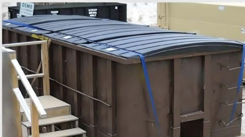
4 panels will cover a standard (20'L - 23'L) roll-off dumpster

Our industry first, patent pending, cost-effective solution for preventing ground water pollution and unauthorized access to your dumpster IS JUST A PHONE CALL AWAY!